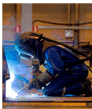
Picture: The correct working method, the blower unit air hose must not be pinched.